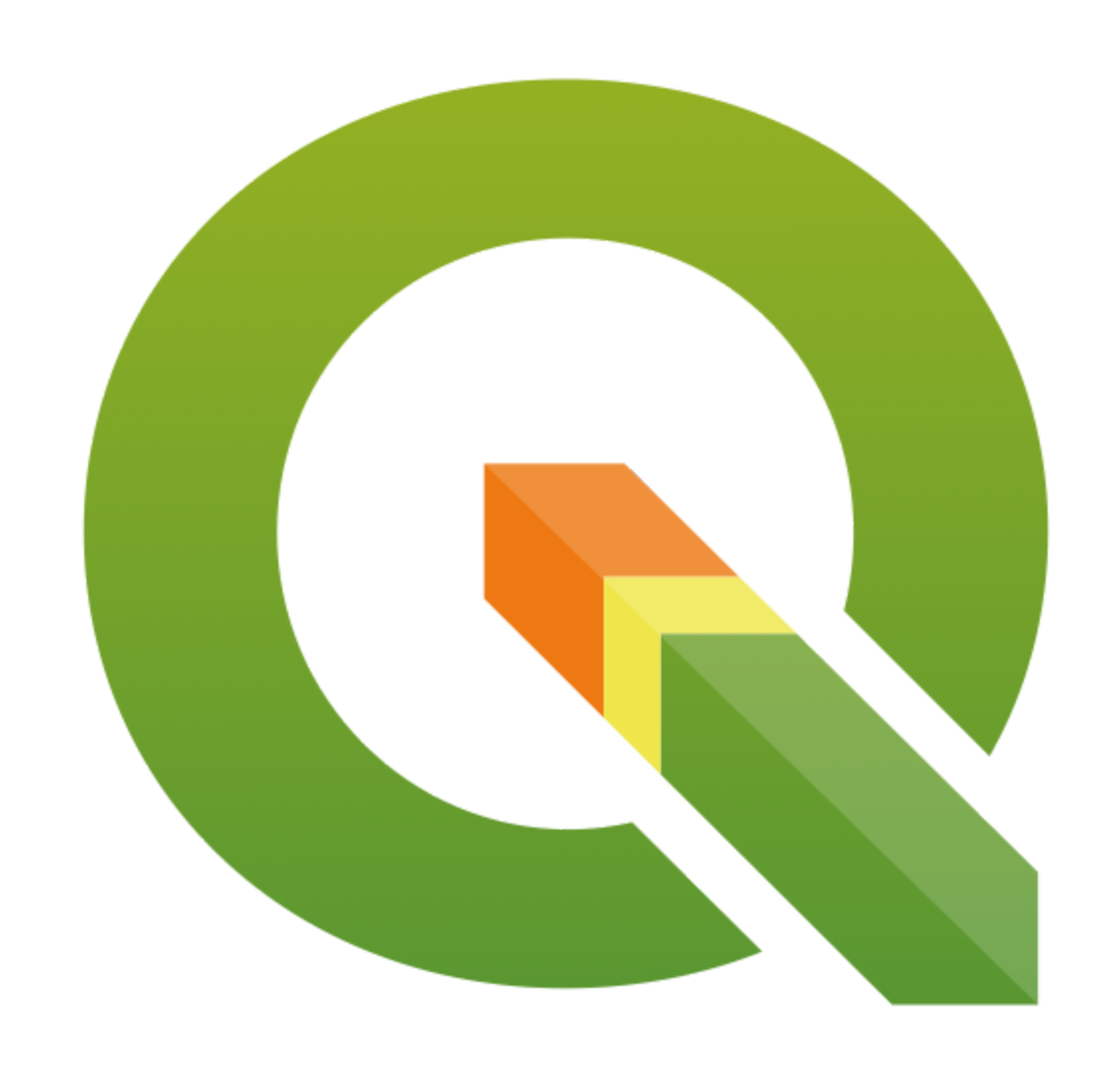
QGIS.ORG - Annual Report 2017